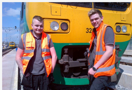
Apprentices at Tyseley depot