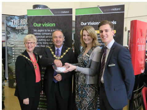
Dudley Army Reserve Centre

London Midland's engineering team based at Tyseley depot in Birmingham, scooped a handful of awards at this year's Golden Spanners Awards. The ceremony, which is sponsored by industry magazine 'Modern Railways', was held at the Grand Connaught Rooms in London.